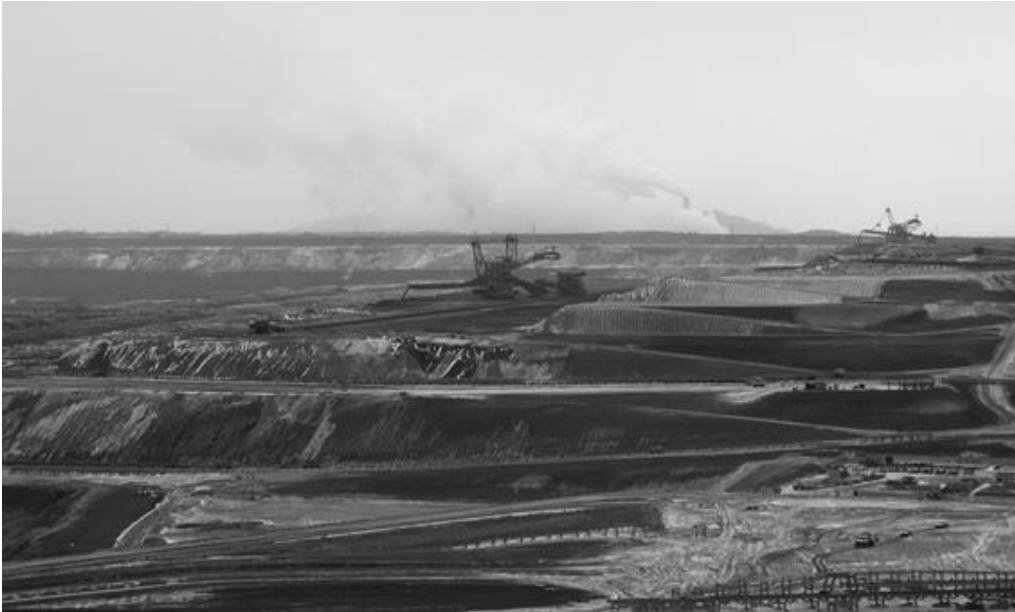
Figure 2: Garzweiler Opencast Mine in Rhineland Brown Coal Field

... The digging method causes characteristic differences. Deep mining produces different types of environmental impact than opencast mining.